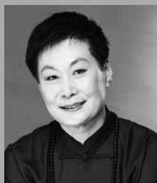
裴艷玲 Pei Yanling

著名戲曲表演藝術家，國家一級演員，河北省京劇藝術研究院院長。出身梨園世家，五歲登台，九歲挑樑，文武兼備，京、崑、梆俱佳，被譽為「國之瑰寶」。中國戲劇梅花大獎、白玉蘭戲劇表演藝術特殊貢獻獎、第二屆中華藝文獎得主，其代表作《寶蓮燈》、《哪吒鬧海》、《鍾馗》及《響九霄》均被拍成戲曲電影。現任中國文聯副主席、中國戲劇家協會副主席。